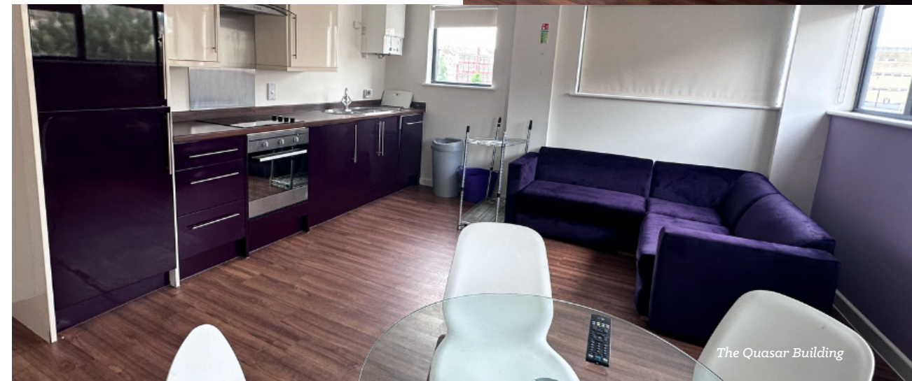
The Quasar Building