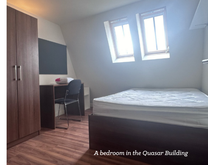
A bedroom in the Quasar Building