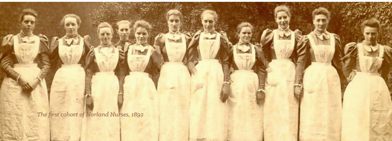
The first cohort of Norland Nurses, 1892